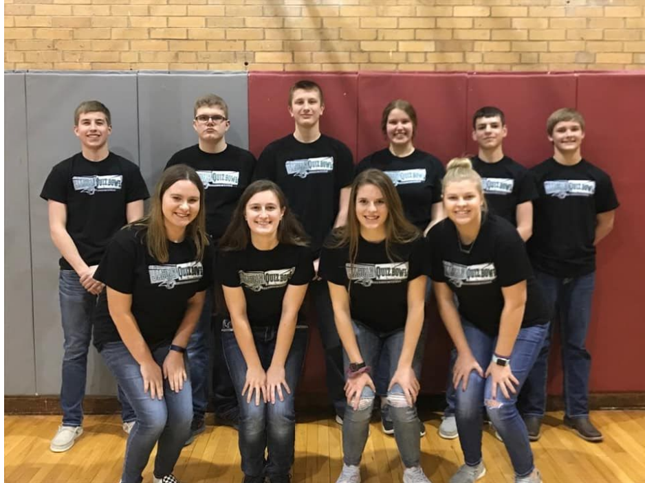
Jaguars are 2020 District Quiz Bowl Champions.